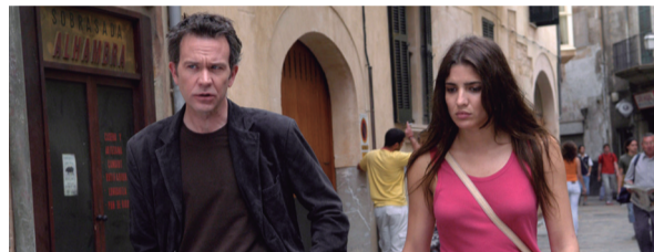
The Kovak Box (2006)