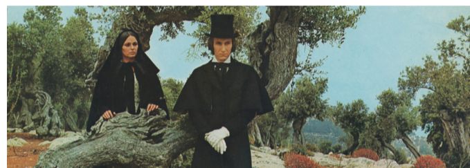
Jutrenka. Un invierno en Mallorca (1969)

Tour 2. Raixa, Cala Fornells, Formentor.